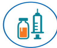
Get Recommended Vaccines