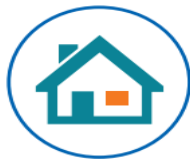
Stay Home When Sick